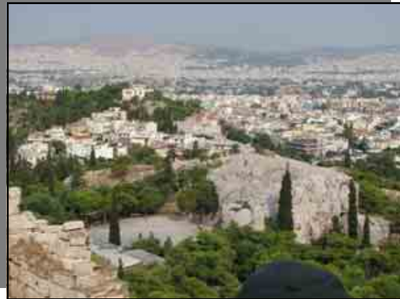
MARS HILL WHERE PAUL PREACHED TO THE ATHENIAN PHILOSOPHERS (Read Acts 17:32-34)

My writing project will attempt to "take the ancient measure" of the spread of the Gospel and to reflect upon and write about it. I'm excited that this is a project with a focus on biblical discovery, having obvious action implications for today.