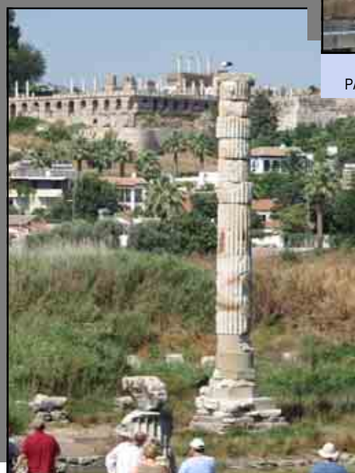
THE TEMPLE OF ARTEMIS AT EPHEBUS (FOREGROUND) THREATENED BY THE POWERFUL PREACHING OF PAUL (Read Acts 19:27)

Travel in the ancient world was a challenge and those who braved the challenge were true heroes. But if Luke is anything, he's a realist and he tells us that geography was not the only gap to be closed. The "great moves" in witness quite consistently occurred against different kinds of resistance and opposition. Resistance came not only from