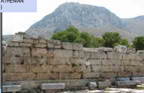
THE JUDGMENT SEAT OF GALLIO AT CORINTH WHERE PAUL WAS BROUGHT BY ANGRY JEWS (Read Acts 18:9-10)

writing project with the provisional title, The Book of Acts in Its World . There was also a family excursion to the Mediterranean to see and photograph ancient locations where the Gospel was first